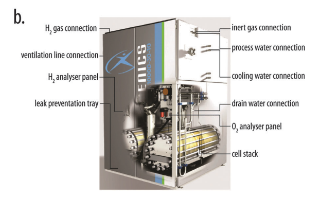
Fig. 1 (a) A schematic illustration of a simple U-tube configuration for water electrolysis. Voltage penalties (overpotentials) increase the total voltage required to operate the system at a given rate relative to the thermodynamically required potential, and include the kinetic overpotentials associated with the hydrogen-evolution and oxygen-evolution reactions (\eta_{\rm HER} and \eta_{\rm OER} , respectively), the concentration overpotential (\eta_{\rm con}) , and ohmic resistance loss ( \eta_{ohm} ). The total operating voltage of the system is given by the sum of the thermodynamic voltage for the water-splitting reaction and the total overpotential, \eta_{\text{total}} , for the system. (b) A schematic illustration of a commercially available (Hydrogenics) alkaline water electrolyzer with auxiliary components.7

transfer between most metal electrodes and a species in solution are slow for complex, multi-step electrochemical reactions, including reactions as simple as the two-electron reduction of two protons to form a single molecule of H<sub>2</sub>. <sup>12,13</sup> The overpotential partially overcomes the activation barrier for such processes, with the exact partitioning of the potential between the liquid and the kinetic barrier depending on the details of the system. Assuming an Arrhenius-type relationship for the interfacial charge-transfer kinetics yields an exponential relationship between the overpotential and the rate, or current density, j, of the reaction of interest: